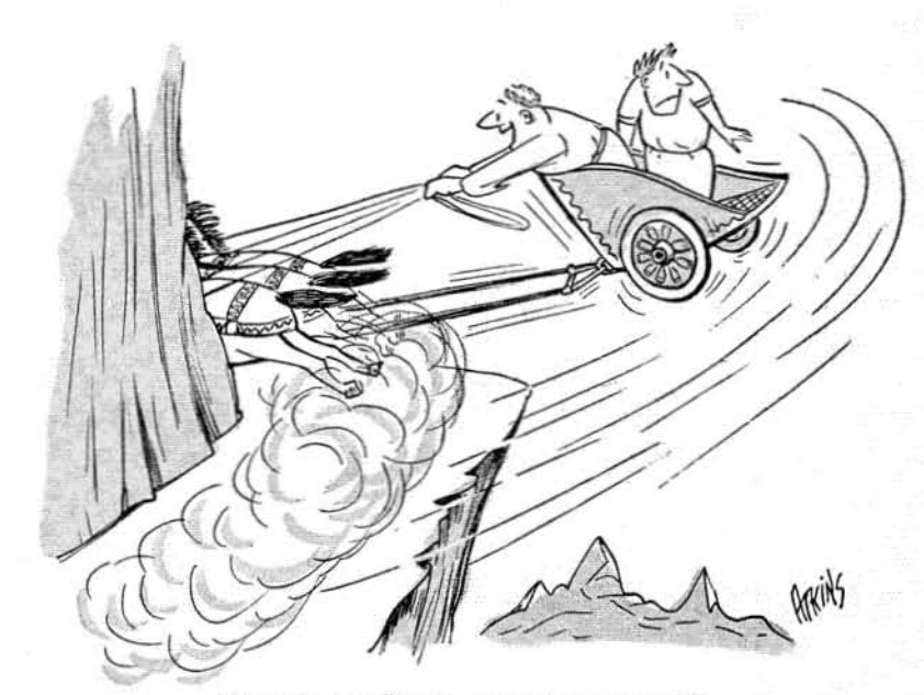
"How do you like the way she 'corners'?"