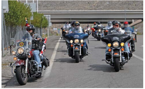
The American Legion Riders represent one of the fastest growing membership segments of the nation's largest veterans service organization.

Three months of community outreach to make your town a Legiontown will enhance your post's image and should significantly increase participation in your post's programs. Just as important, it will offer unlimited opportunities to invite those veterans that are your neighbors but not yet carrying an American Legion membership card to join the very best veterans organization in the community, state and nation. As your post holds and coordinates all these activities, take advantage of every opportunity to seek out and invite potential members to join. Be sure to give them the Legiontown, USA and Four Pillars booklets and answer their questions. Parents, teachers, first responders, business owners and employees, retirees and National Guard and Reserve troops will all see the advocacy and service of The American Legion during your Legiontown campaign and should be honored to carry the title of Legionnaire. Just ask them.