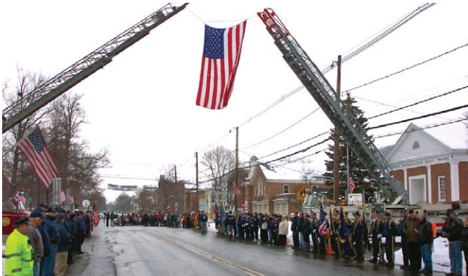
Coordinating patriotic community events is one way to keep your post visible.