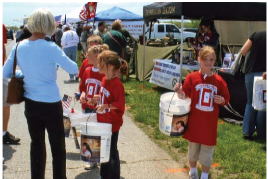
People of all ages can contribute to successful Legiontown events.

A partnership is a good idea when done with the media. For example, holding the event in conjunction with a local radio station will guarantee plenty of publicity (on that station) and most likely a live remote broadcast from the event, plus teasers on most of their shows for weeks prior to the event. In some cases, partnering with the local newspaper and a radio or television station is possible and increases coverage potential. As with sponsors, approach the publisher/station manager as far as possible in advance of the scheduled event. One year out is not too early.