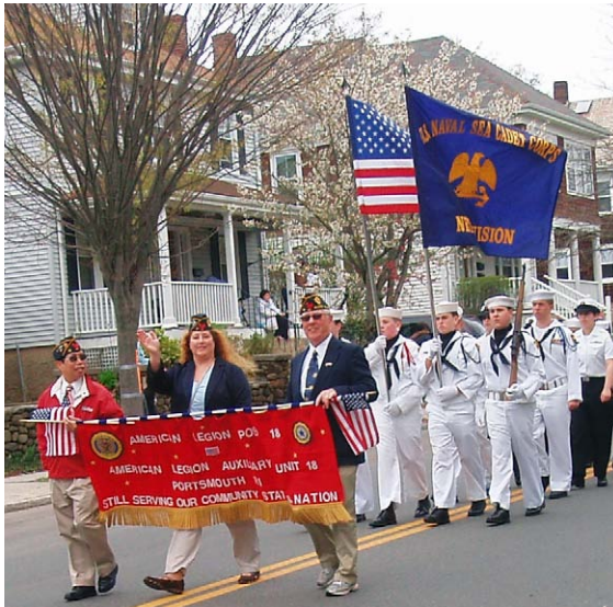
Making your town a Legiontown requires visibility, service and commitment.