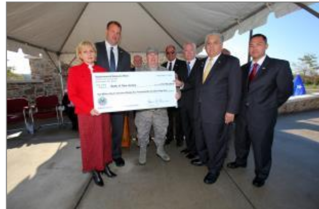
Grant Award Presentation November 2012 BG William C. Doyle Veterans Memorial Cemetery, Wrightstown, N.J.,