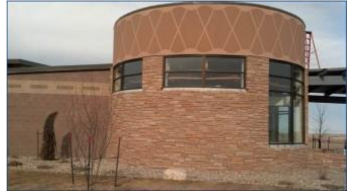
Administrative Building Sicangu Akicita Owicahé (Rosebud Sioux Tribe Veteran Cemetery) White River, SD