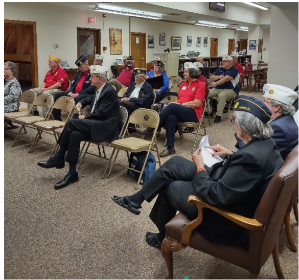
NADHAL members at the NADHAL meeting at the National American Legion Library on Tuesday, October 5, 2021.