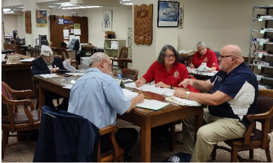
Historians judging history books at the National American Legion Library on Monday, October 4, 2021.