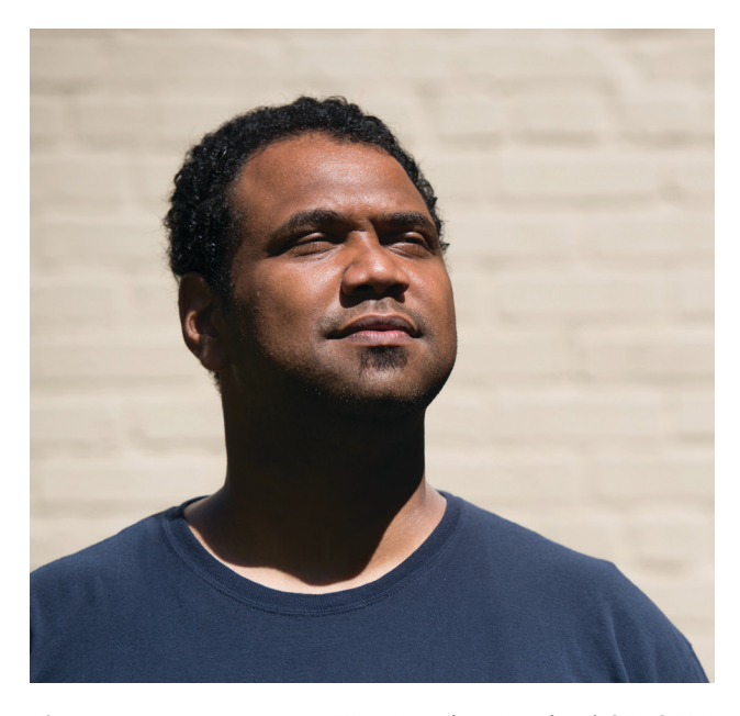
The American Legion | ON-CALL

To sign up for federal grant notifications and updates, visit grants.gov . Additionally, NCHV newsletters feature both private and federal grant opportunities for service providers.