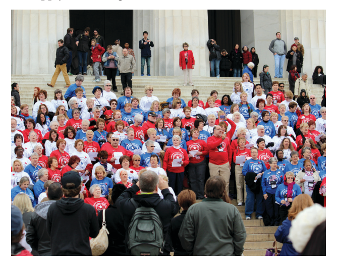
The American Legion | ON-CALL