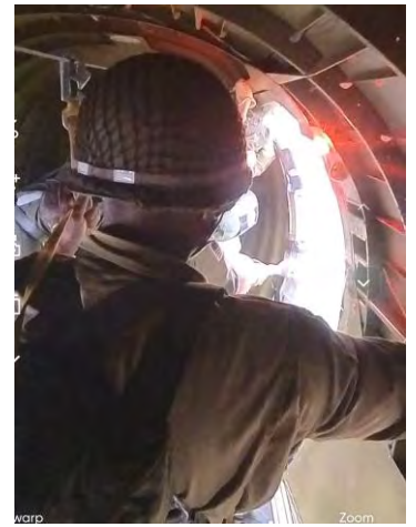
“At the Door” Under red interior lighting, a paratrooper prepares to leap into the Normandy skies — the very moment of airborne history recreated.