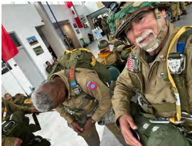
“Getting Rigged Up into Parachute Harnesses at the Airport” Paratroopers prepare for the jump by getting rigged into their MC1-1C parachute harnesses at the airport — a crucial moment of focus and teamwork before boarding the aircraft.