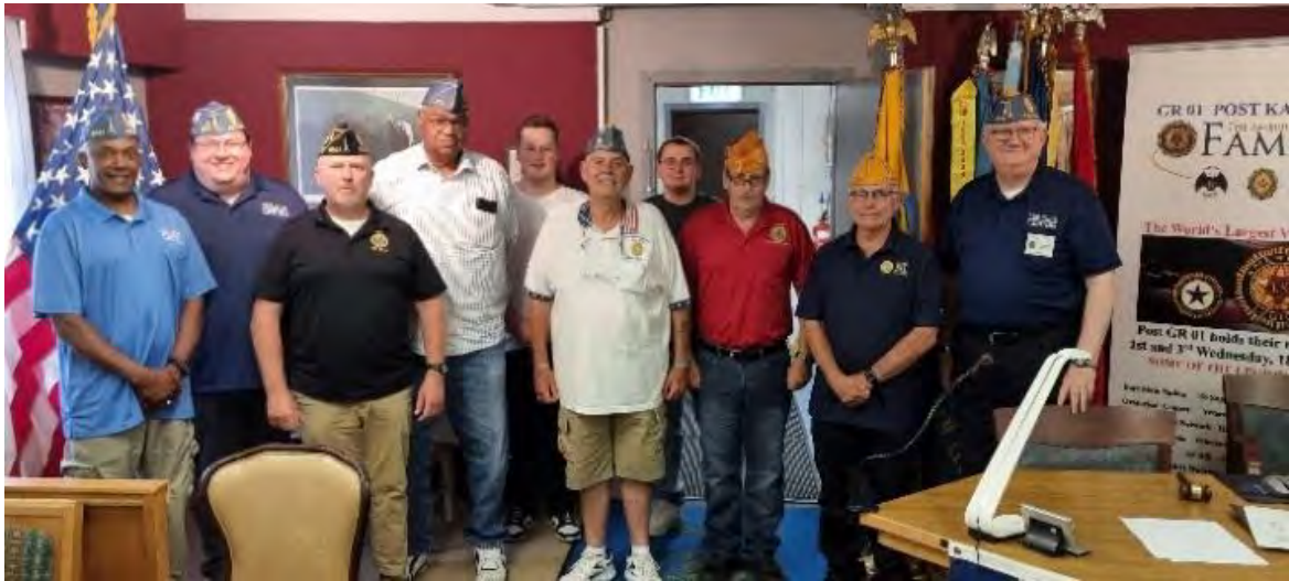
SAL DEC held on 7 June 2025 at the GR01 Post Home