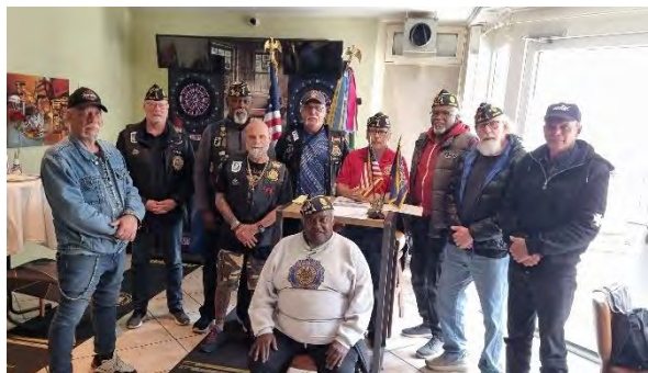
GR79 meeting for our 4 th of July Fest 2025