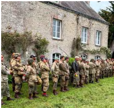
“Forming Up at the Assembly Area” Paratroopers, clad in WWII-style uniforms, form up outside a stone farmhouse in

Normandy. This gathering echoes the moments of readiness experienced by the original Pathfinders before their historic jump.