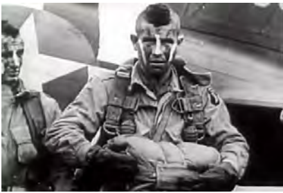
Ready for war: a Pathfinder moments before boarding the C-47.