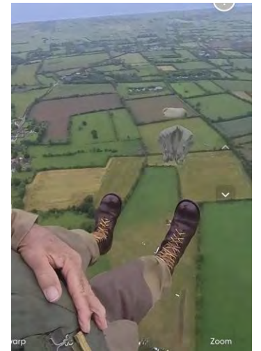
“Over Normandy” A breathtaking perspective from under canopy as a jumper floats above the patchwork fields of Normandy, boots and legacy dangling in the wind.