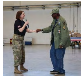
USAREUR-AF Soldiers' Chorus member Sings a Tune from the Vietnam War Era to a Vietnam Veteran.