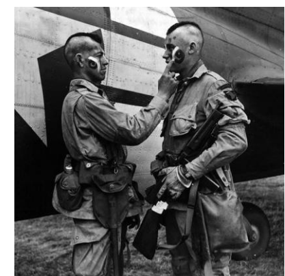
Symbol of unity: war paint and war readiness among 101st troopers.