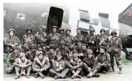
Pathfinders of the 3rd Battalion, 508th Parachute Infantry Regiment, prepare to board a C-47 for the Normandy jump, June 5, 1944.

Company, 2/325 Airborne Infantry Regiment and B Battery, 1/320 Field Artillery. He later commissioned as an Air Defense Artillery officer before transitioning to the Military Police Corps. After leaving the Army, he received a direct commission into the U.S. Air Force, where he served as a Security Forces Operations Officer.