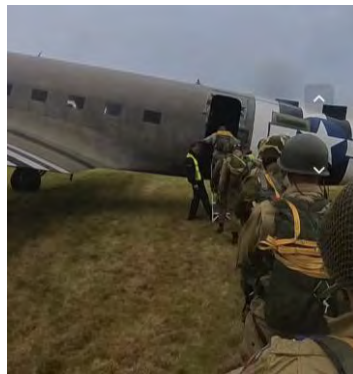
“Loading the C-47” Paratroopers ascend the steps of a vintage C-47 Skytrain, evoking the hauntingly familiar sight of D-Day’s airborne assault.