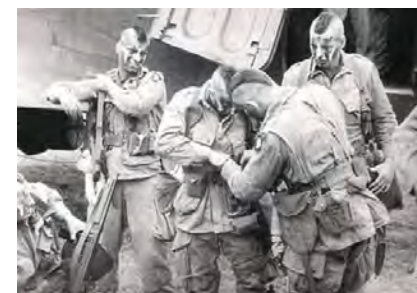
Paratroopers from the 101st Airborne Division paint their faces and ready their gear in the hours before the jump.