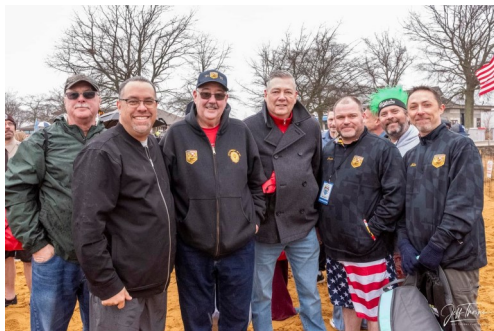
Sons getting ready for the Plunge