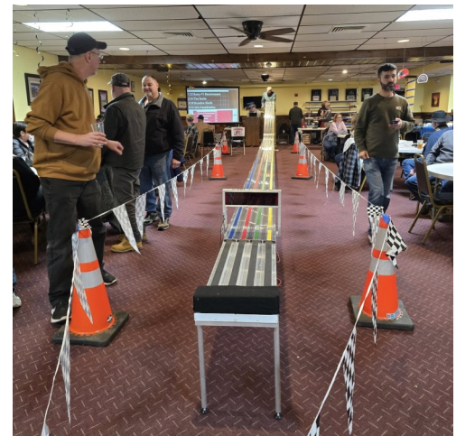
Squadron 414 (Sutton, MA) holds their 3rd Annual Adult Pinewood Derby