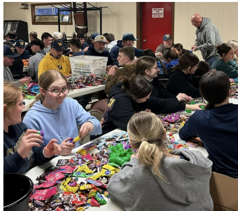
Squadron 371 (Welston, OH) brings together students and coaches from Welston High School to help stuff Easter eggs in preparation for their upcoming annual Easter egg hunt.