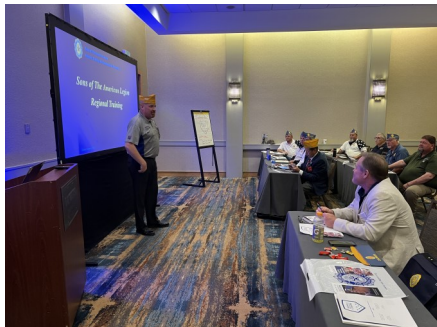
Submitted Photo: Regional Training in Boston