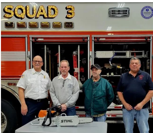
Sons donate a Stihl rescue tool to the Rescue Hose Company

The Rescue Hose Company has a new rescue tool thanks to Sons of The American Legion of Greencastle American Legion [Squadron] 373.