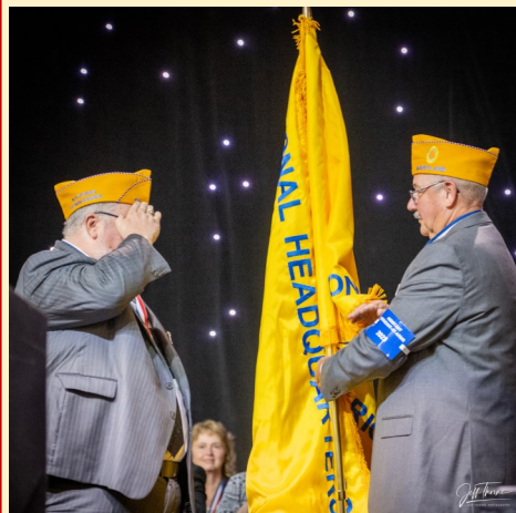
National Convention 2023

One of the functions of the Sergeant-At-Arms is to watch over the membership for flag etiquette. If someone is not rendering honors, the Sergeant-At-Arms should politely instruct the member or guest in the proper procedures. The Sergeant-At-Arms should tell members, guests, and comrades to never to walk or pass between the flags. Always walk around the outside of the flag when going behind the Commanders table.