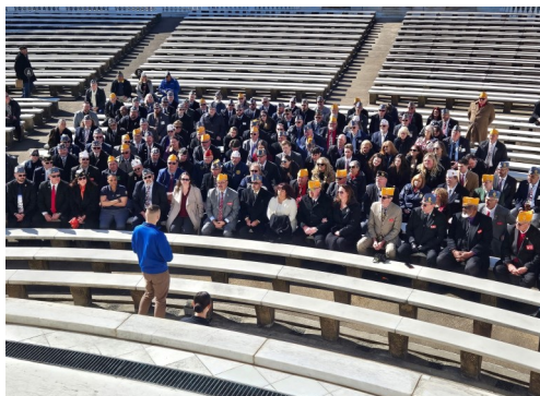
Attendees at the Arlington Wreath Laying are addressed by the Tomb Guards of the US Army 3rd Infantry Regiment, "The Old Guard"