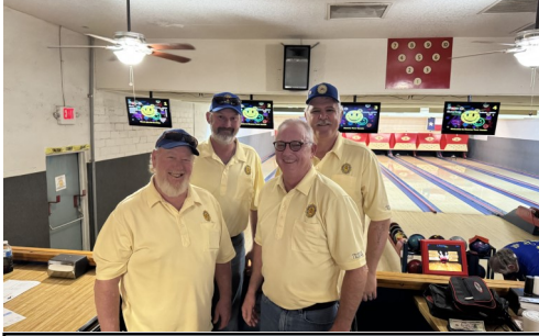
Squadron 208 (Kerrville, TX) held a bowling tournament with I Strike Sports. The Tournament had a great turnout and raised $1,357.50