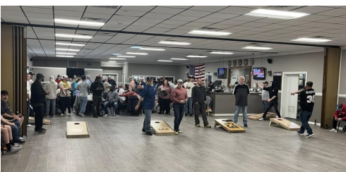
Squadron 274 (Lusby, MD) has a huge turnout for their corn hole tournament