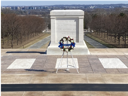
SAL Wreath after being placed at the Tomb of the Unknowns

those who gave their lives without recognition, while the World War II Memorial, Vietnam Wall, and Korean Memorial stand as powerful reminders of the bravery and sacrifices made during those pivotal conflicts. Each site offers a profound moment of reflection, allowing us to