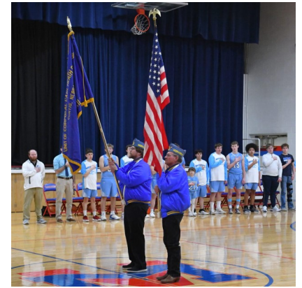
Squadron 95 (Curtis, NE) performing colorguard duties