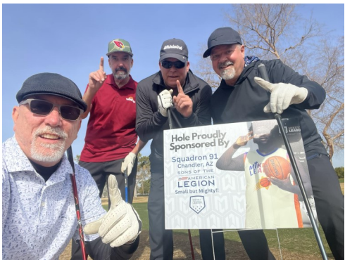
Squadron 91 (Chandler, AZ) supporting Mikey's League by sponsoring a hole in their golf tournament