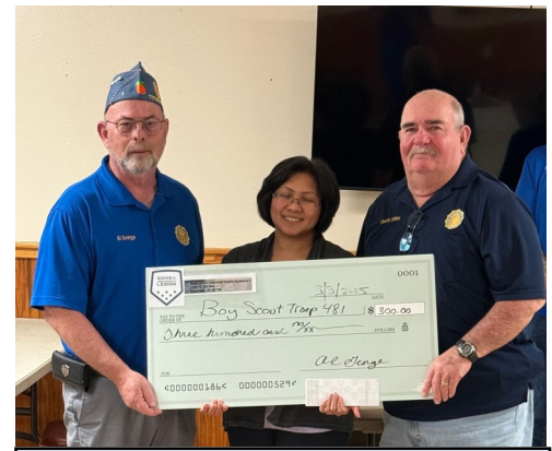
Squadron 1 (Titusville, FL) makes a donation to Boy Scout Troop 481 for their help at the SAL Car Show