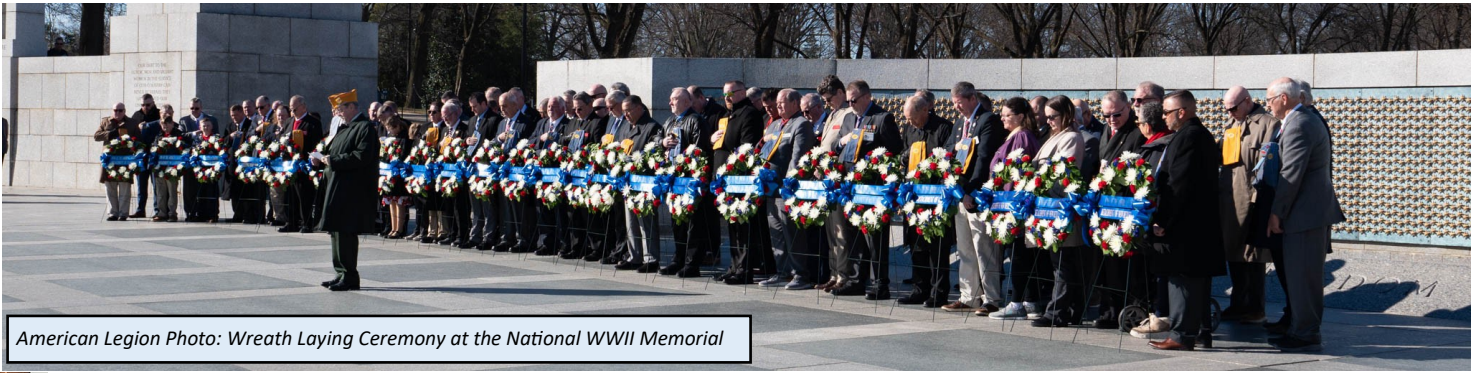
Wreath Laying Ceremony at the National WWII Memorial