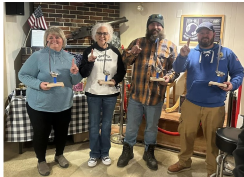
Squadron 86 (Grey, ME) hosts a Chili and Chowder Cookoff with 20 entries and 76 judges.