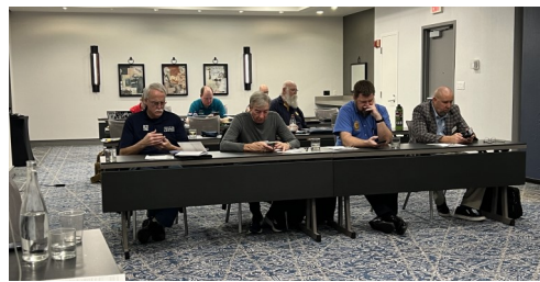
Submitted Photo: Regional Training in Boston

The American Legion held its second National Regional Information Conference in Boston on Feb.1, where Legionnaires and Sons of The American Legion members received training on the organization's mission, operations and programs. The training was held in conjunction with the Auxiliary's Mission Training at the Hyatt Regency Boston Harbor hotel.