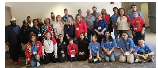
NJ Legion Family in Boston

"Every time I listen to the national judge advocate, I pick up more information pertaining to the Constitution and Bylaws interpretation that were not clear prior."