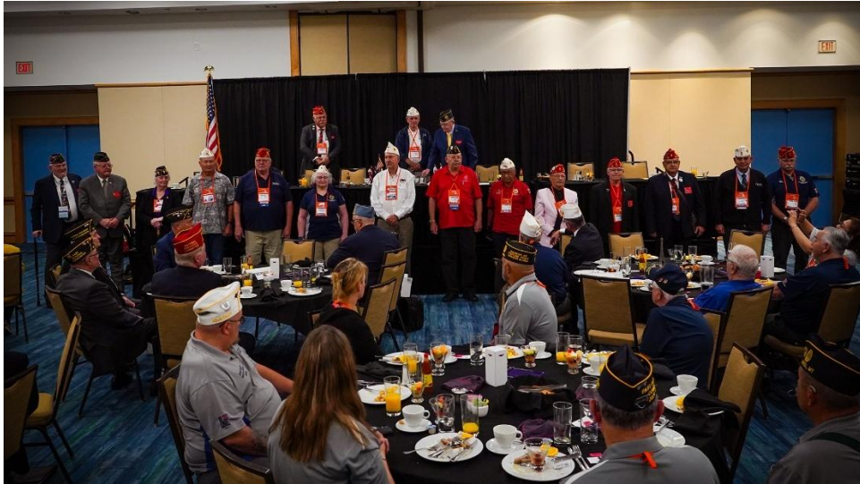
New Foreign and Outlying Posts and Departments of The American Legion officers were elected during the FODPAL breakfast at the 2025 National Convention.

Legionnaires from around the world hear from national commander candidates, present awards for membership growth.