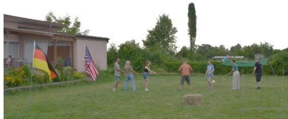
Members preparing for a tug of war