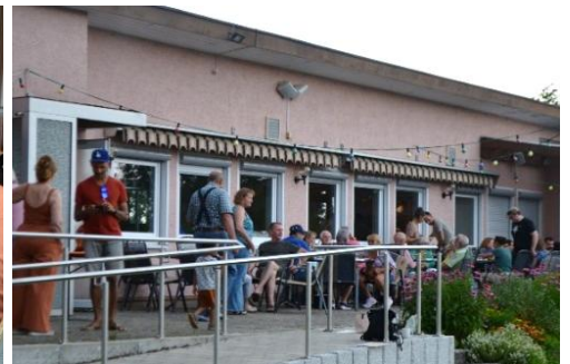
Perfect weather allowed guests to mingle outside