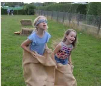
Whoever thought gummy sack races were out of style