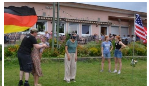
Blindfolded limbo dance? Not sure how that worked out