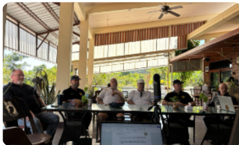
The meeting was held at Mooky's cafe.