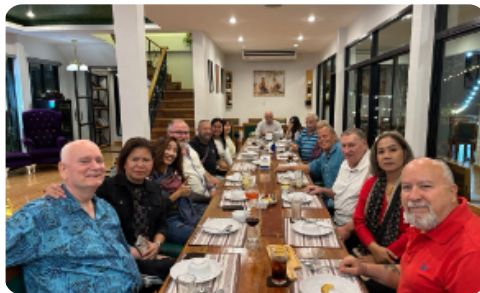
In January, we took the show on the road to Mukdahan and held a social dinner the day before our Post monthly membership meeting.