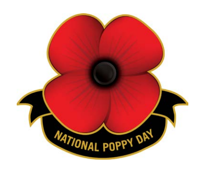
Table of Contents National Poppy Day Event Toolkit