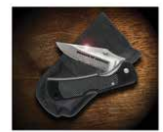
Branch of Service Knife