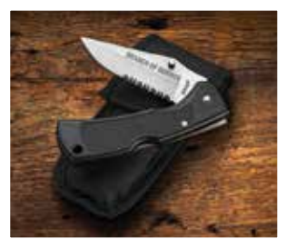
Branch of Service Knife