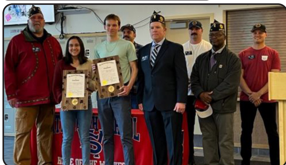
Post 13 and their School Medal Award winners.