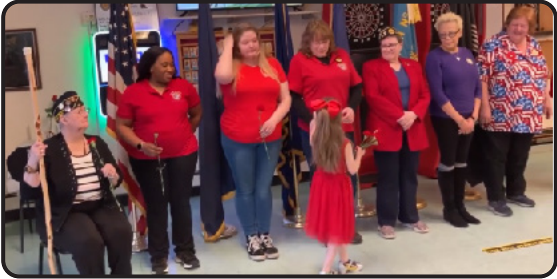
C Russell Huber Unit 57 2023 - 2024 officers are presented with flowers by one of their youngest ALA members.