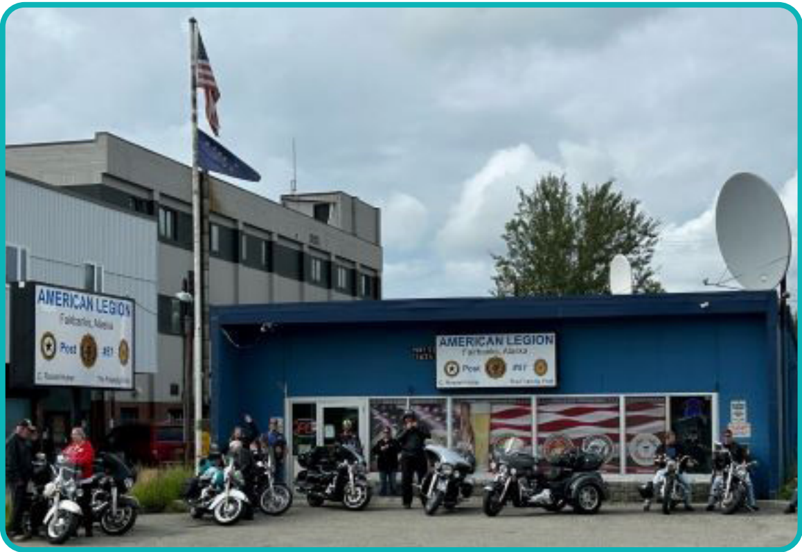
CR Huber Post 57