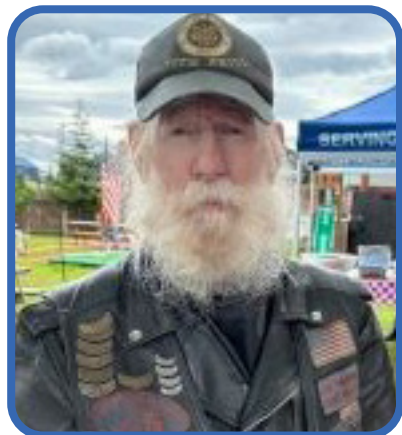
(this guy doing it in his style)