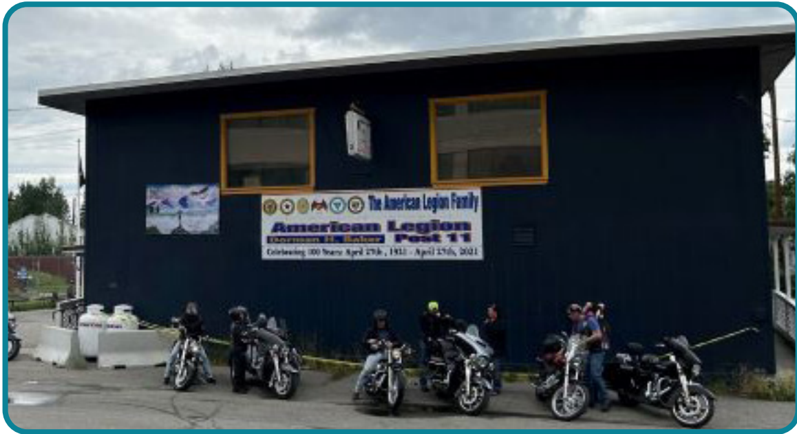
Dorman H. Baker Post 11