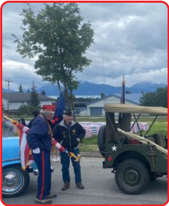
4th of July North Pole style!