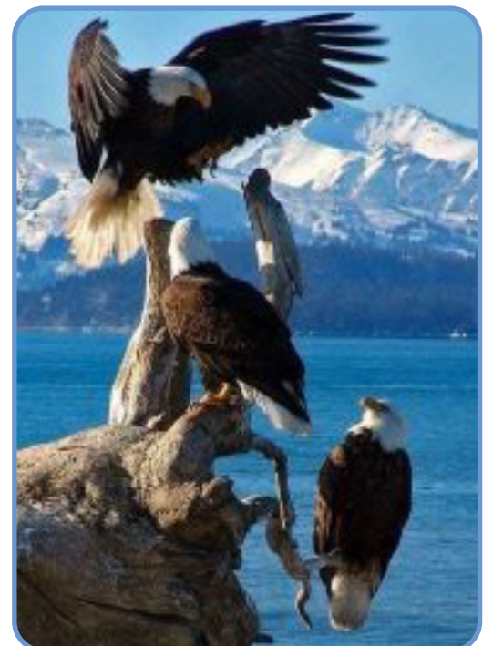
A flash mob of Bald Eagles