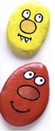
Susitna Valley Post 35 Jr. Auxiliary painted and hide rocks around the Wasilla War Monument for those lucky ones to find!!