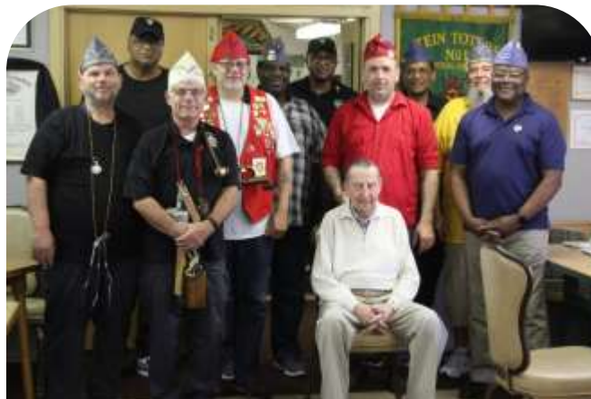
Grand Promenade/Elections 2022MY, Kaserlauteren, Germany 17 July 2021

Membership is by invitation, and open only to honorably discharged veterans and honorably serving members of the United States Armed Forces.