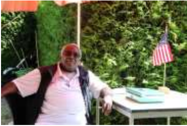
GR79's newest member