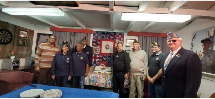
Kaiserslautern Post GR01 Legion Members