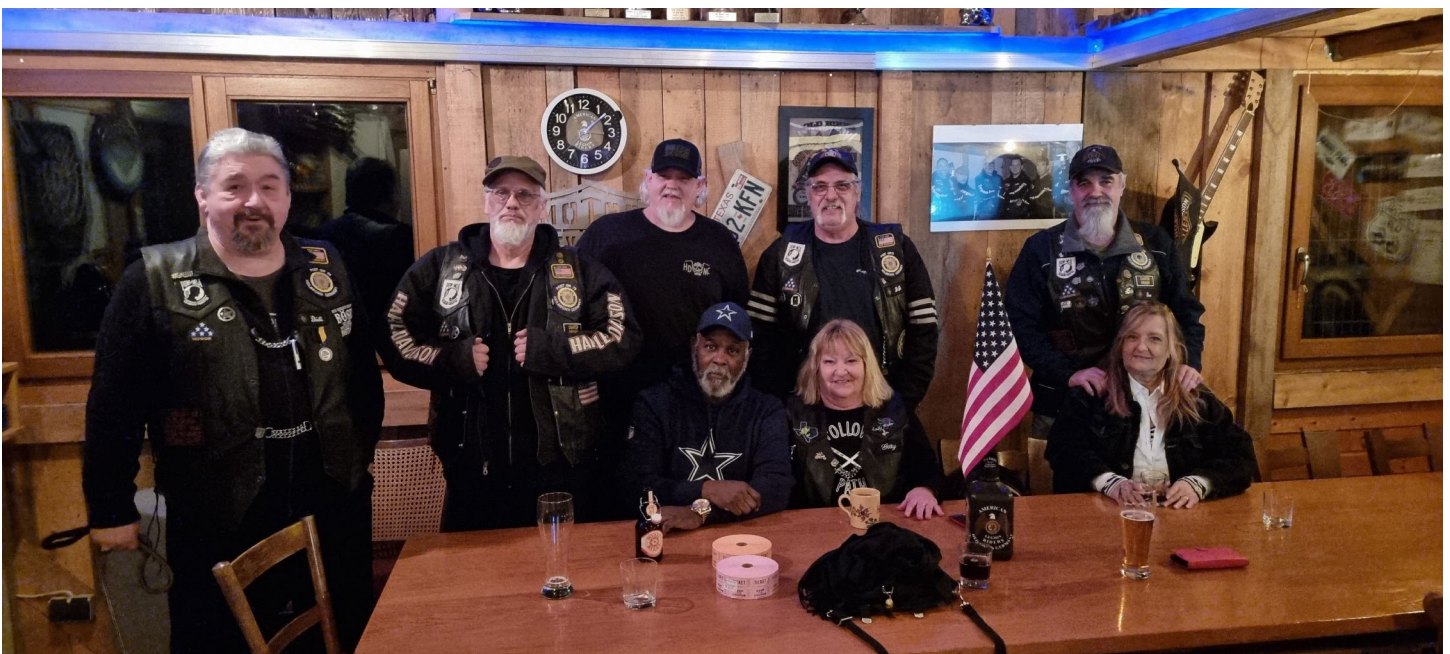
GR79 LEGION RIDERS