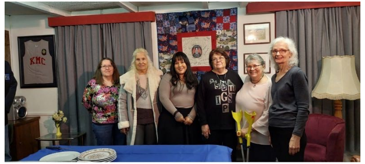
Kaiserslautern Unit GR01 Auxiliary and Guests