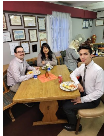
Everyone enjoying some great food!