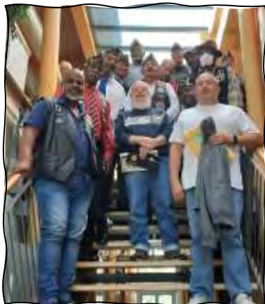
General Membership Meeting

4 th of July fest: Legion and SAL members