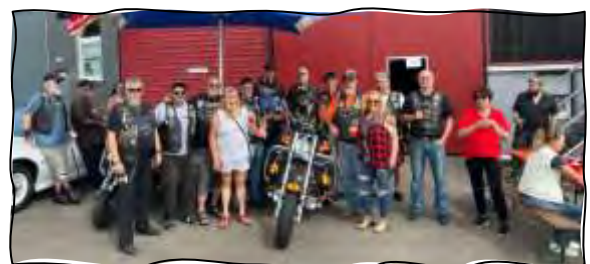
Legion Rider Biker fest.