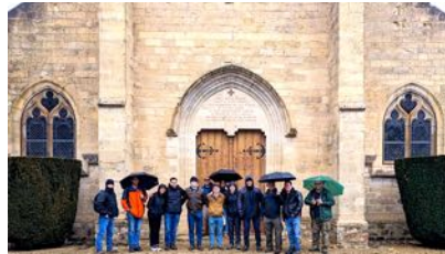
Group photo in front of the Church of Belleau, France

Both Saint-Cyr cadets and West Point cadets showed their duty, honor and country by singing historic songs from each of their own schools.