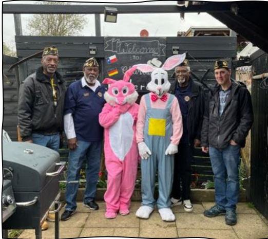
GR79 Easter Bunny