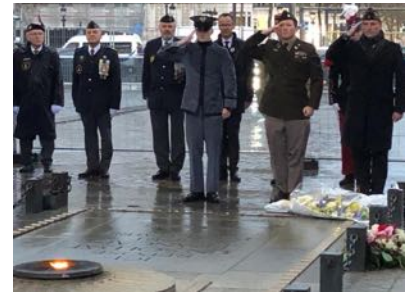
Active duty, cadet, and veteran, standing together as Americans honoring France's Unknown Soldier

The Arc de Triomphe de l'Étoile is one of the most famous monuments in Paris located at the western end of the Champs-Élysées, not far from Pershing Hall, at the center of Place Charles de Gaulle, formerly named Place de l'Étoile - the étoile (in French) or "star" of the juncture formed by its twelve radiating avenues.