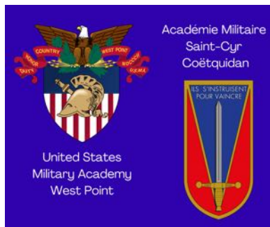
West Point's long legacy with France

It was an historic moment seeing American and French cadets meeting each other under the Arc de Triomphe!