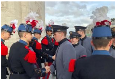
Meeting Saint-Cyr cadets at the Arc de Triomphe!

Lots of smiles (and epiphanies) from our young historians as they handled this historic book collection!