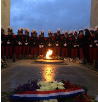
Duty, Honor and Country

We are very thankful for your participation and hard work!