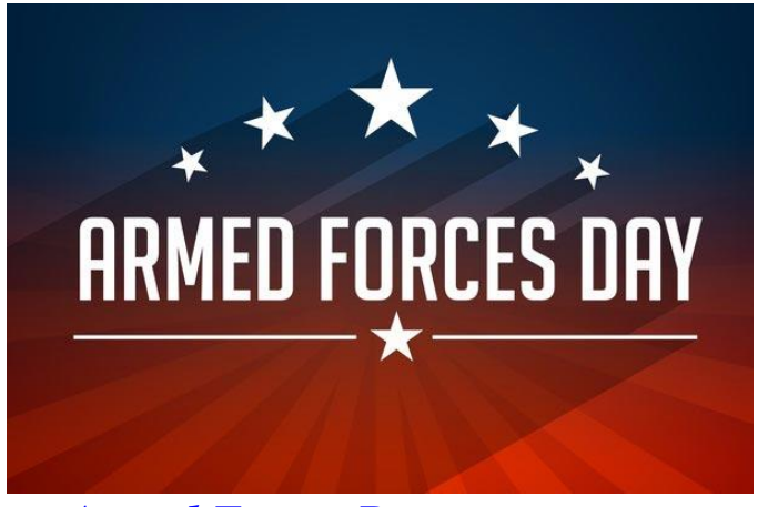
Armed Forces Day May 18, 2024

American Legion Family members celebrate Armed Forces Day to honor the men and women who serve in the United States military.