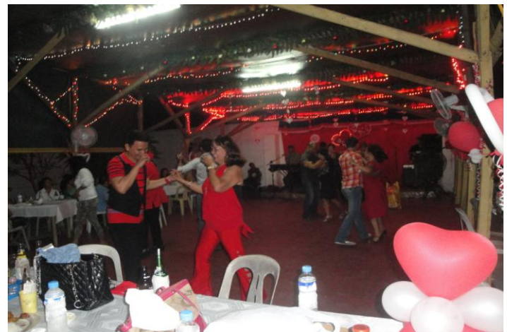
February 9, 2013 -Our Fundraising Ballroom Dancing held at Post 123.