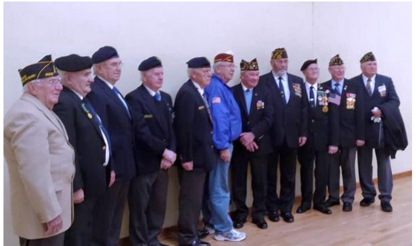
With our Irish counterparts at Lecarrow, Co. Roscommon