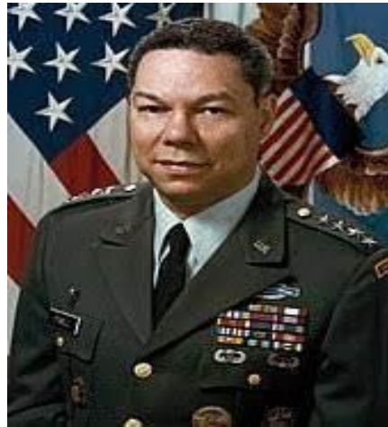
General Colin Powell