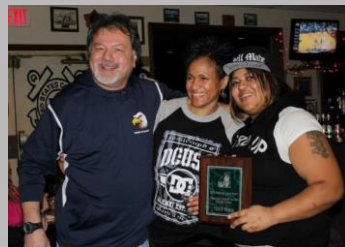
Karaoke Contest Contestants