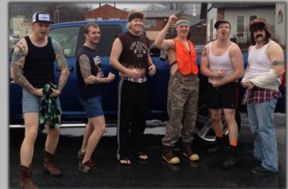
Mustaches and Mullets Jump Team