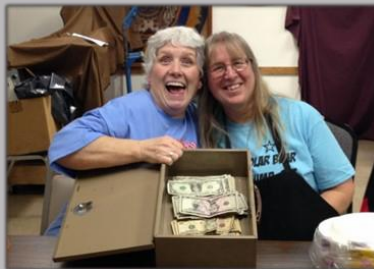
Polar Bear Breakfast Fundraiser

Welcome to February 2015!!!! After the new year we had a snapshot of time to catch our breath but we were back at it with the hugely successful 30 th anniversary of the Polar Bear Jump-off Festival in January. It was a fast-and-furious weekend and a lot of good work went along with the activities. I can't say enough in thanks to all our volunteers! You guys make it happen, whether with fabulous food, supporting auctions, running the Karaoke Contest or down on the docks helping the jumpers - you did it all, and with such style! ☺ I also want to thank those who came to the post to help out this cause by making donations, bidding on the fun items for the auction and cheering on the contestants in the Karaoke Contest. It was a great time by all. This town and state is amazing how it pulls together to help others. What is really notable is the fact that many of these wonderful people are members of our American Legion Family right here in Seward who continually step up to the plate and make things happen! Thank You for all you do in service for our veterans and our community.