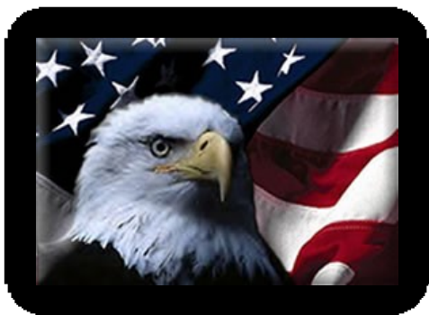
Department of Hawaii