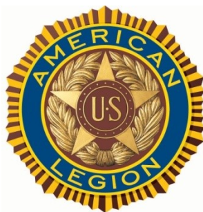
“Yanks Down Under” Post AU01